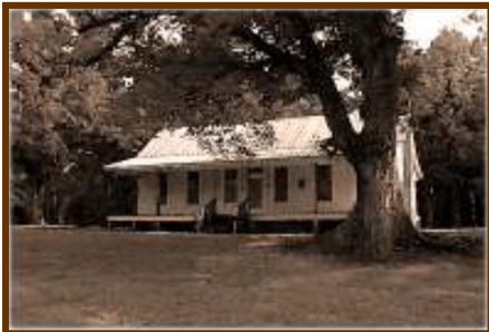
Historic Peter Cauble House was built in the late 1830s at Peach Tree Village, Tyler County, Texas.