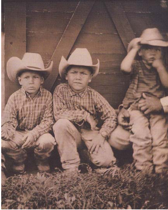
Image taken from an original photograph by Robb Kendrick in "Revealing Character" Series.