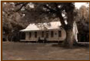
Historic Peter Cauble House was built in the late 1830s at Peach Tree Village, Tyler County, Texas.