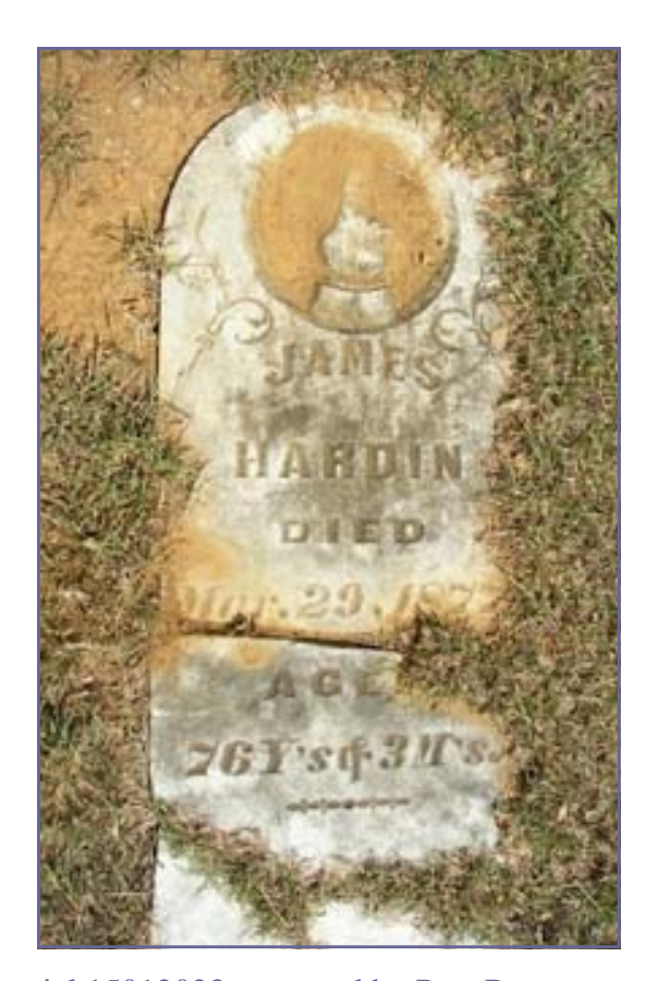
Image: Memorial 15012023 as posted by Pete Rost at www.findagrave.com